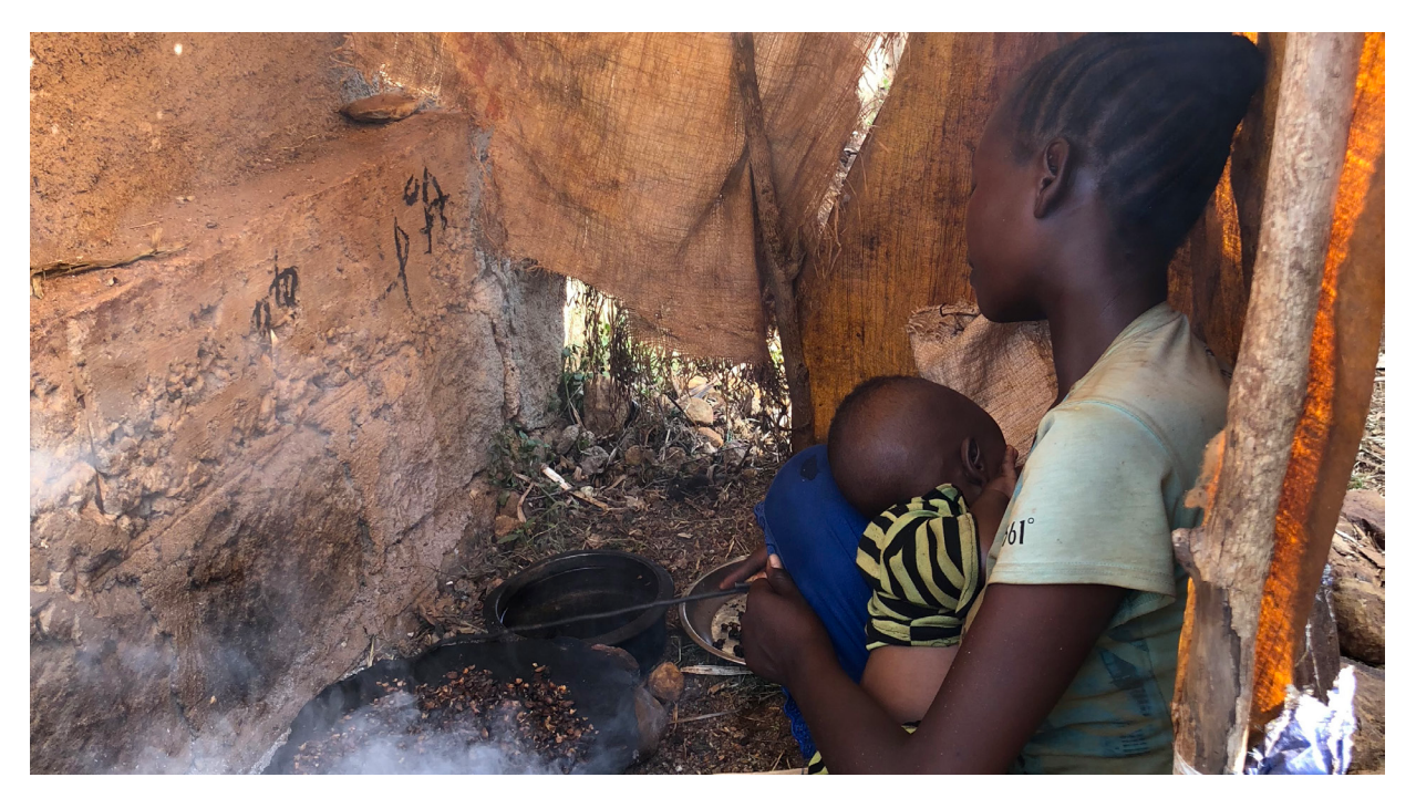
An IDP family living in a makeshift shelter in an informal, secondary displacement site on church grounds where almost 6,000 IDPs were living in squalid, unsanitary, and unsafe conditions. West Guji Zone, Oromia Region, Ethiopia.

U.S. Forest Service. In creating a new unit of the NDRMC, the government should seek to partner with agencies specialized in conflict-induced crises, such as the U.S. Office of Foreign Disaster Assistance (OFDA) or the European Union's European Civil Protection and Humanitarian Aid Operations (ECHO).