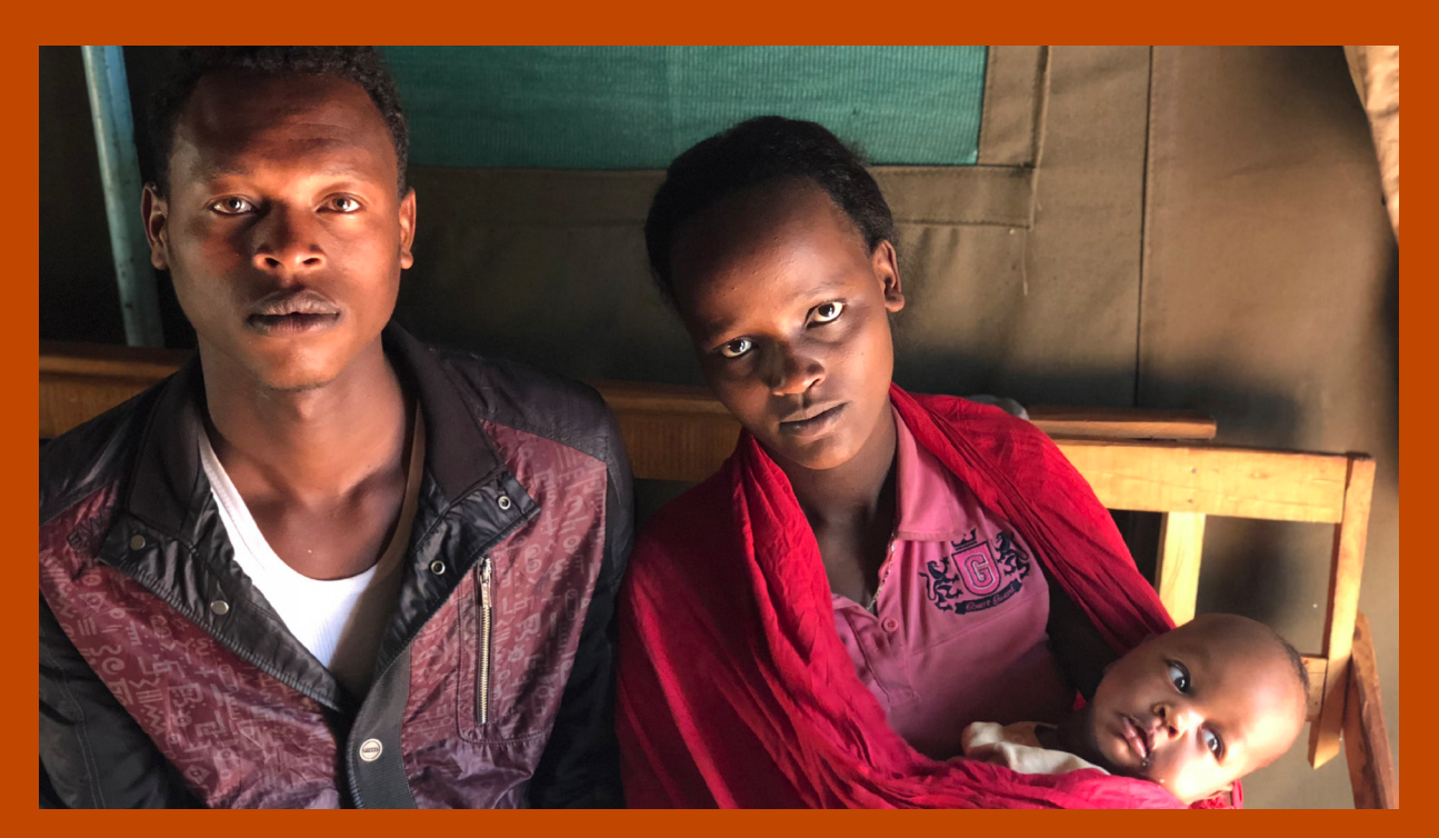
A displaced family with a newborn baby. When asked why they haven't returned home, the young father explained, "We fear for our safety. There is no peace. I fear the people who did this are still there. They burned our houses – mine, my brother's and mother's – and 40 sacks of maize." West Guji Zone, Oromia Region, Ethiopia.

area is usually a coffee market. Now we are being told to leave. This area belongs to rich coffee growers who want their land back. . . After September, coffee harvesting will begin. But who will construct our houses?" She told RI that in addition to a new shelter, her family urgently needs food, water, tools and equipment for farming, cooking utensils, and clothing. We asked her whether she was able to take anything with her when she fled. "No one preferred clothes or equipment to their lives."