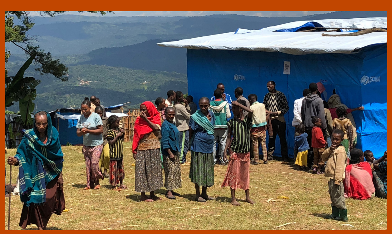
Secondary displacement site near Yirgacheffe, Gedeo Zone, the Southern Nations, Nationalities, and Peoples' (SNNP) Region, Ethiopia.

1. Name changed to protect the identity of the interviewee